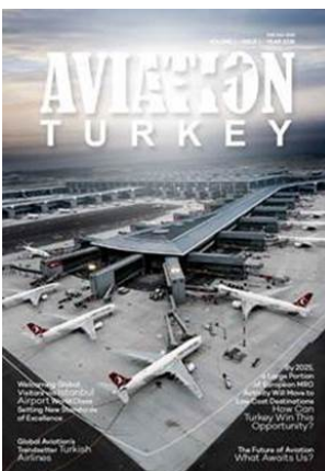
@ Issue #1