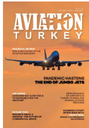
@ Issue #6