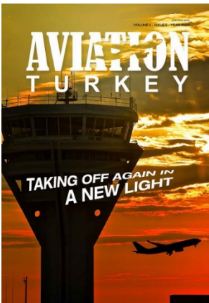
@ Issue #5

...coming issue, Aviation Turkey #8 is on the way!