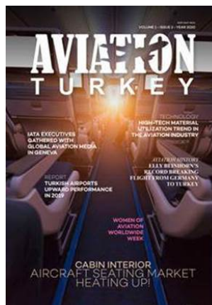
@ Issue #3