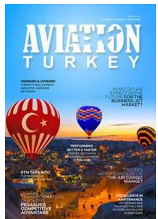
@ Issue #2