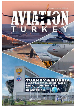
@ Issue #7